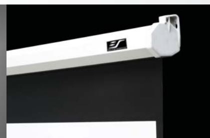
Available in Black and White Casing Colors.