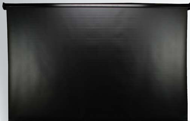
Black-Backed Screen Material

Elite Screens' MaxWhite Screen Material is durable for daily use and Easy to Clean. It has a wide viewing angle with 1.1 Gain and is suitable for most applications including Commercial /Educational and Residential. MaxWhite Screen material has a black backing to eliminate light penetration for superior color reproduction. Its Texture pattern eliminates Moiré or Hot Spotting which is a common phenomenon with poorly made projection screen material or wall projections.