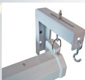
Optional 6", 12" or 18" Brackets provide more flexibility with an installation.